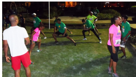
Warm up time