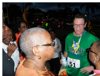
Congrats on a job well done

THE CDB Team would like to thank all staff who came out and supported them during the Run Barbados Series