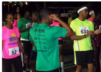
Earphones in; Music check