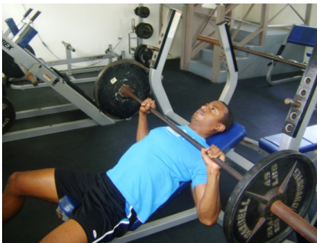
Incline Barbell Bench Press